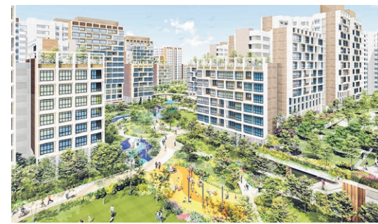
Garden Vines @ Tengah

*2-room Flexi flats come in two sizes – 36/38 sqm (Type 1) and 45 sqm (Type 2).